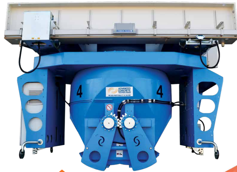
Wiggert flying bucket