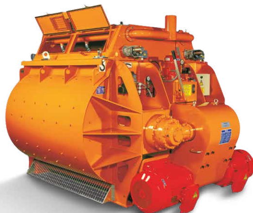
Robust Twin Shaft Mixers DWM 1875 – 6750