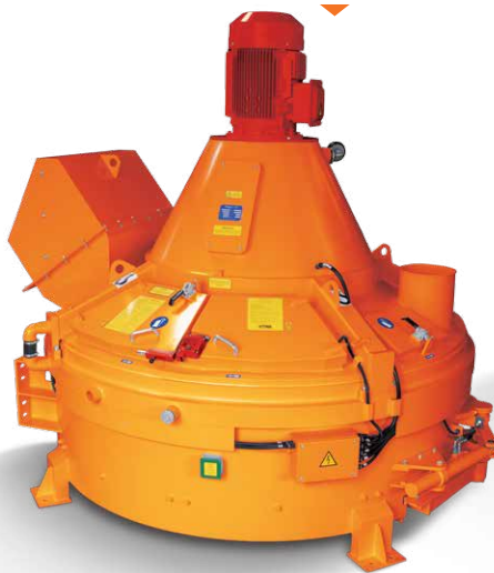
Well-proven Planetary Countercurrent Mixers HPGM 375 – 5250