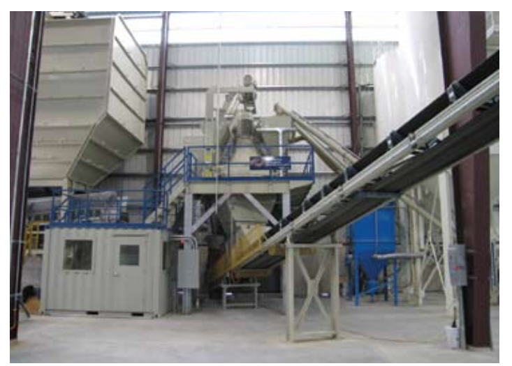
MobilMat Mo 110 Mixing/Batching Plant

Hanson Pipe & Products, Houston Pipe Plant, turned to Advanced Concrete Technology to make improvements in production efficiency and quality at what is a critical facility for this leading manufacturer of dry-cast concrete pipe. Just as with Hanson's neighboring Houston Precast Plant, ACT delivered a turnkey mixing and batching solution that got the plant up and running reliably at capacity faster than alternative solutions.